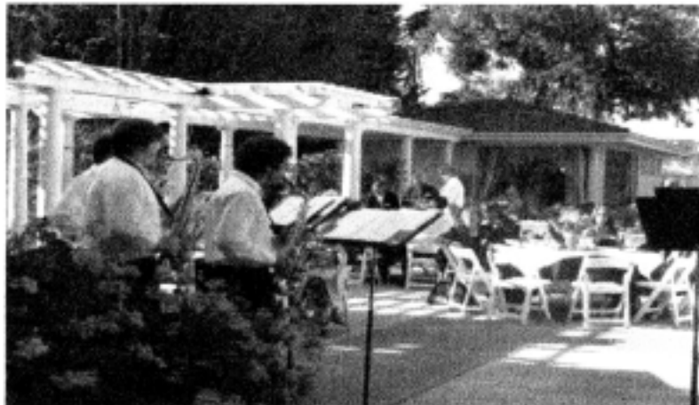
PLHS sax players regale guests at the recent Crescendo fundraiser.

March was "Sleepless in the Band Room", as the Band Council had a Rehearsalathon from 10p.m. to 7a.m. where they played in 45 min. intervals with