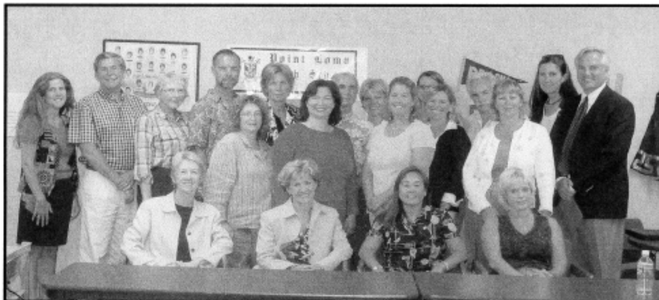
Point Loma High School Foundation and Alumni Association Board of Directors and Club Boosters